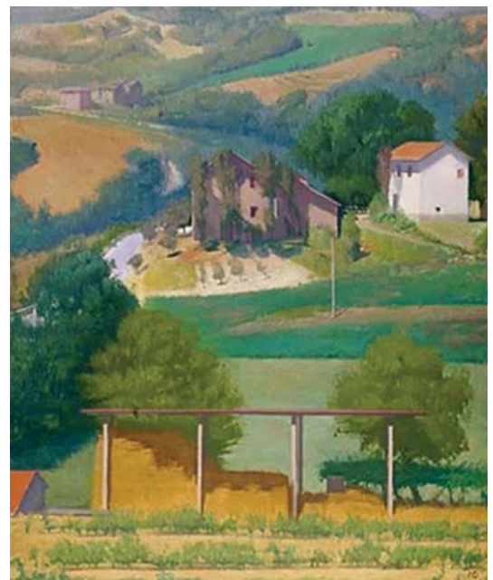
Langdon Quin, Parish, 2002-03, oil on canvas, 40 x 48 inches. on loan from the artist.

Many artists have been influenced by the beautiful country of Italy either by spending time there or possibly studying works of artists that have spent time there. This exhibition will look at those influences and what changes are seen in their work particularly in relation to subject matter, color and space.