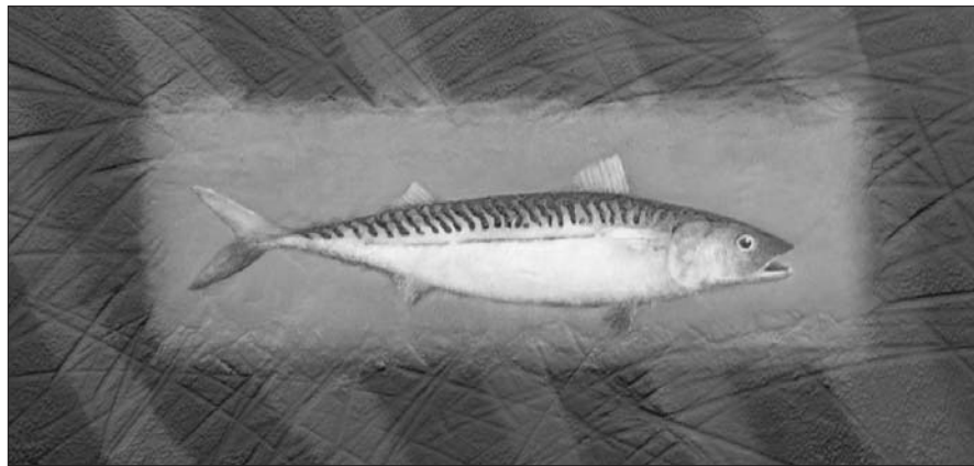
Kevin King, Holy Mackerel XVI , oil and mackerel ash on panel