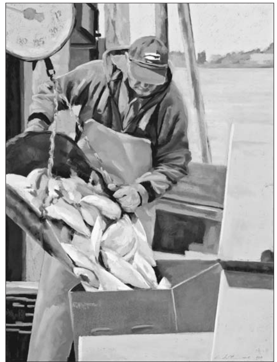
Kimberly Ann duCharme, Fresh Fish , pastel on paper