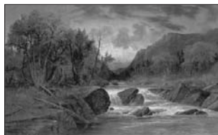
Homer Dodge Martin, Running Brook in the Adirondacks , 1866, oil on canvas

Painted by New York artist Homer Dodge Martin in 1866, "Running Brook in the Adirondacks" was the winner among three landscapes offered for the society's consideration. A yard wide and magnificently framed, the painting is representative of Martin's early period, when he was heavily influenced by the Hudson River School, with its romantic view of America's natural beauty. The setting is the Adirondack Mountains — his favorite