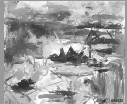
Anne Ierardi, What a Day , 2001, Oil on canvas, 16 x 20 inches