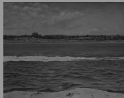
Taylor Fox, Missing the Boat , Oil on canvas

Taylor is a native of Cape Cod and captures the spontaneity of the moment showing the true essence of what is remembered in one's memory. Many new works will be shown in this extraordinary exhibition.